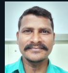
MR. STEPHEN ARUL STORES