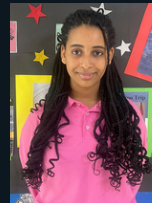
MIRIAM GHIRMAY HIGH SCHOOL