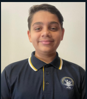
MARWAN WESSAM MIDDLE SCHOOL