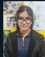
DANA KAMEL ELEMENTARY